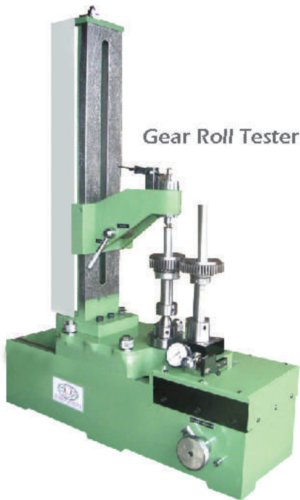
Gear Roll Tester