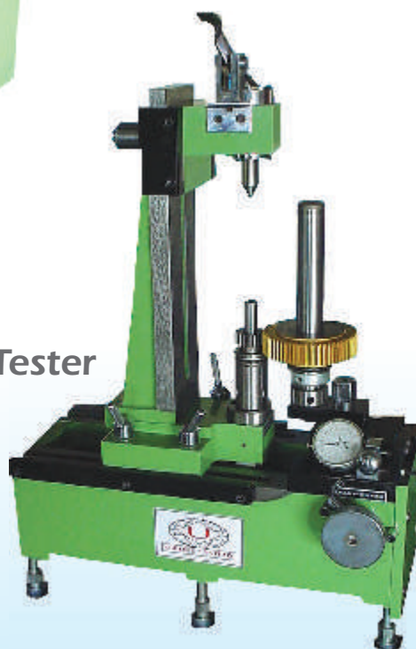
Mini Gear Roll Tester